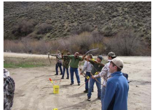
Archer's take aim at our annual bow birds and litter pickup in April.

Again I hope to see you in February at our meeting and again in March at our cabin fever shoot and BHA Rendezvous. Shoot straight.